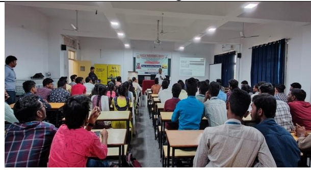
Students and Faculty in the lecture