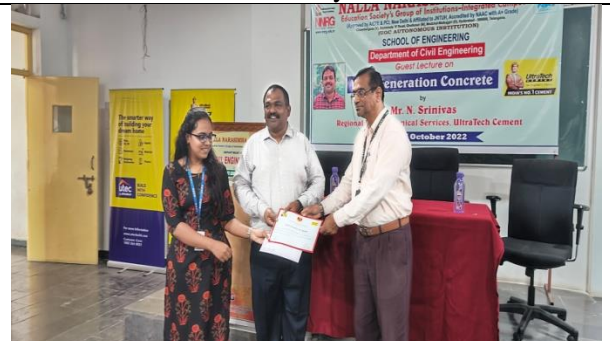
Presentation of Certificate and Cash Prize to the student