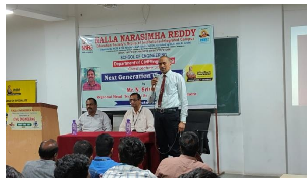
Dean-SoE addressing the students