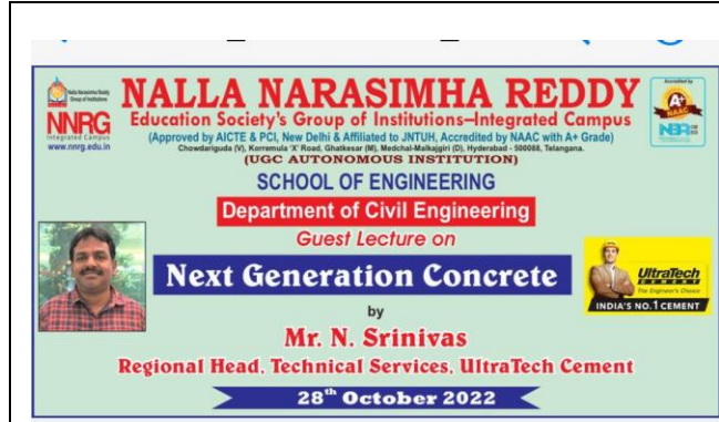
Banner for the Program